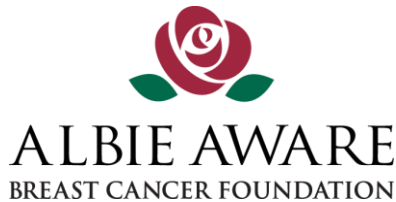
Albie Aware Breast Cancer Foundation

Familia Unida Living with MS provides unconditional love, hope and support to individuals and families living with MS and disabilities to maximize the quality of life.