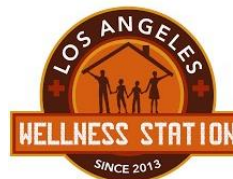
Los Angeles Wellness Station