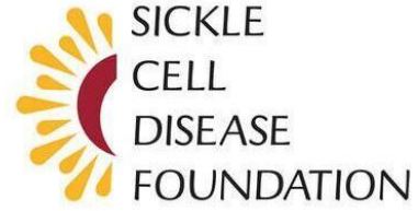
Sickle Cell Disease Foundation