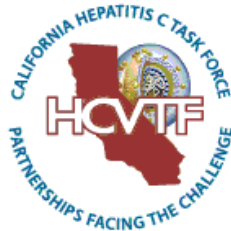
California Hepatitis C Task Force