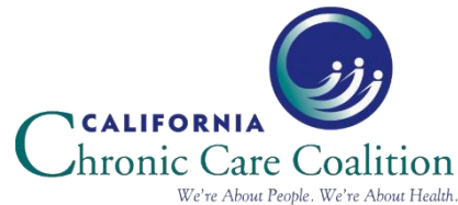
California Chronic Care Coalition