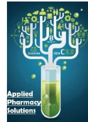
Applied Pharmacy Solutions